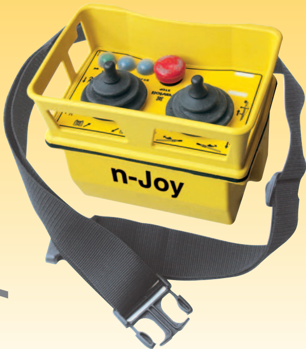
Easily removable battery packs